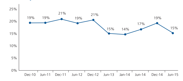
Figure 1. Percentage of survey respondents who needed care but were not always able to receive care, December 2010-June 2015.

who needed care in the last 12 months, stratified by age and health insurance status. Oversamples of an additional 1,500 respondents from select subgroups (minority, rural, Medicaid recipients, and low-income individuals) are included in every other survey wave. The survey results are weighted by key demographics to represent the adult population as measured by the U.S. Census Bureau. Each sample consists of the first 2,000 respondents (3,500 with the oversample) who meet sample selection criteria, but we do not suspect that this nonrandom selection introduces systematic bias. Therefore, we provide confidence bands and statistical tests when appropriate to indicate how reliably the results might be extrapolated to the panel population.