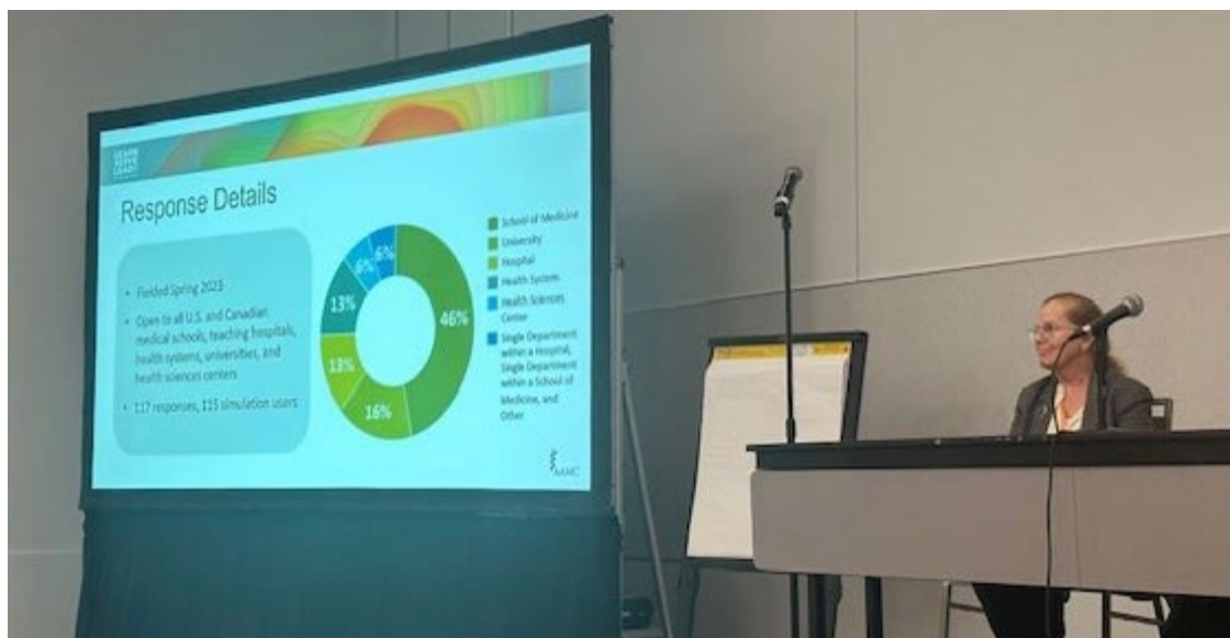
Concurrent session, “Advancing Simulation in Medical Education: Survey Findings and Opportunities for Innovation”.