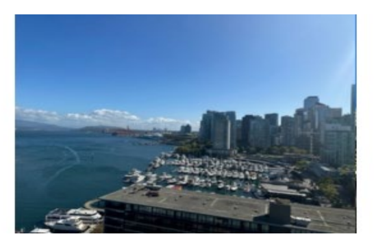
Save the date for 2024: 2024 Principal Business Officers' Meeting Hotel Omni Mont-Royal, Montreal, QC, Canada September 18 - 20, 2024