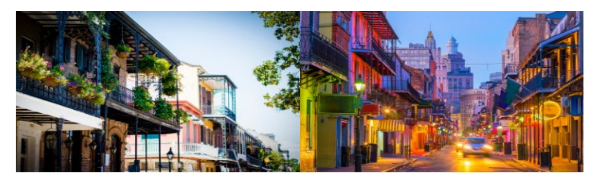
May 29 - 31, 2024 The Ritz-Carlton, New Orleans New Orleans, La.