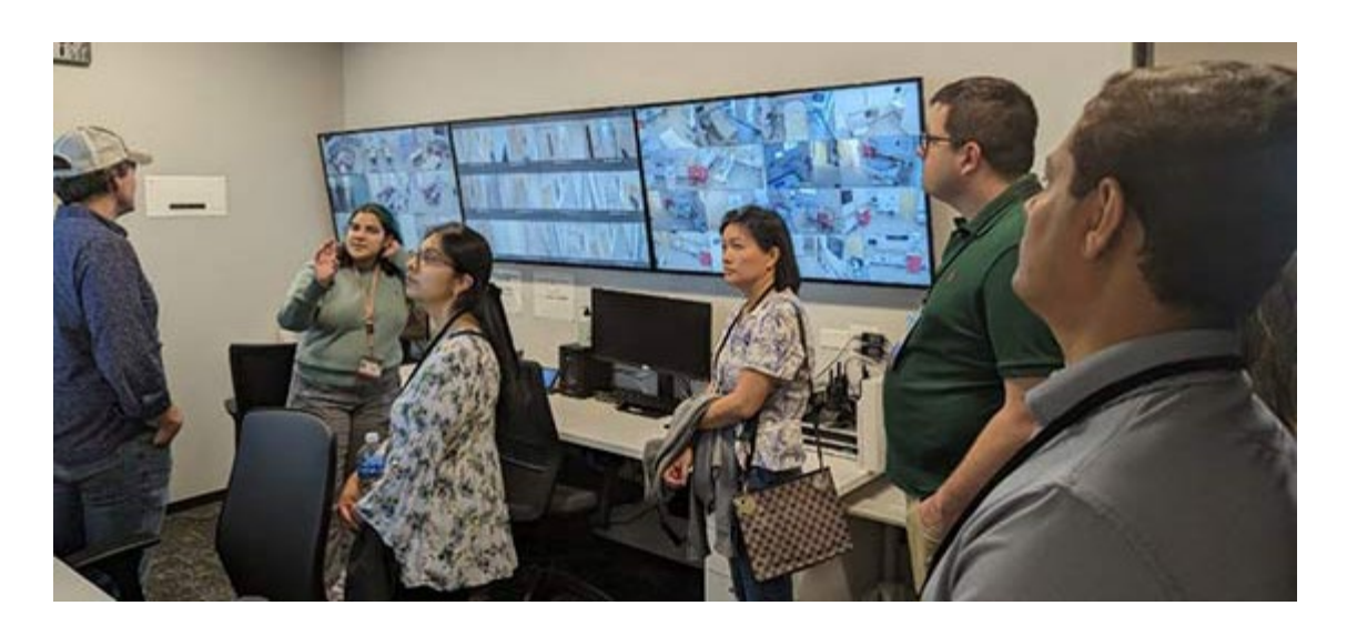
(GIR members learning about the IT components behind the University of Colorado Anschutz Medical Campus' comprehensive simulation center, CAPE.)