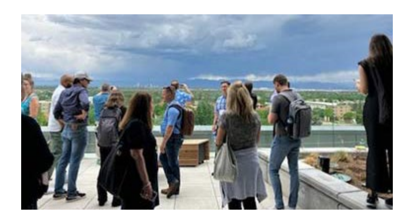
(Participants enjoying the spectacular views during the University of Colorado Anschutz Medical Campus tour.)