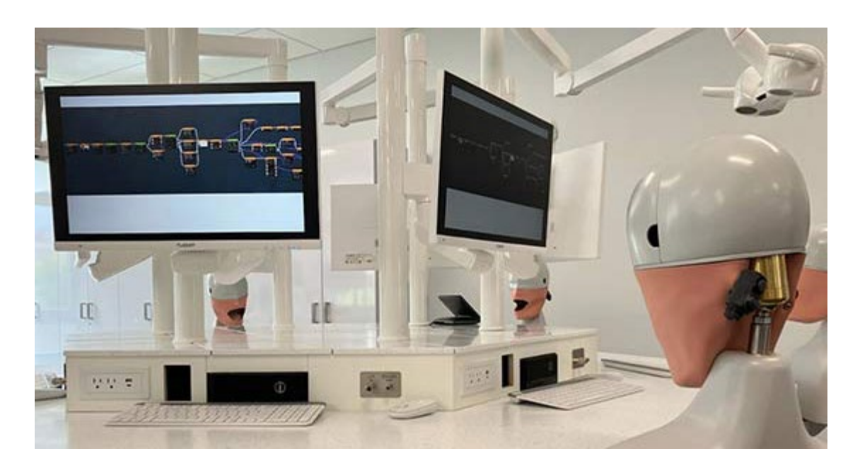
(A view of the University of Colorado Anschutz Medical Campus, School of Dental Medicine VR lab and simulation lab.)