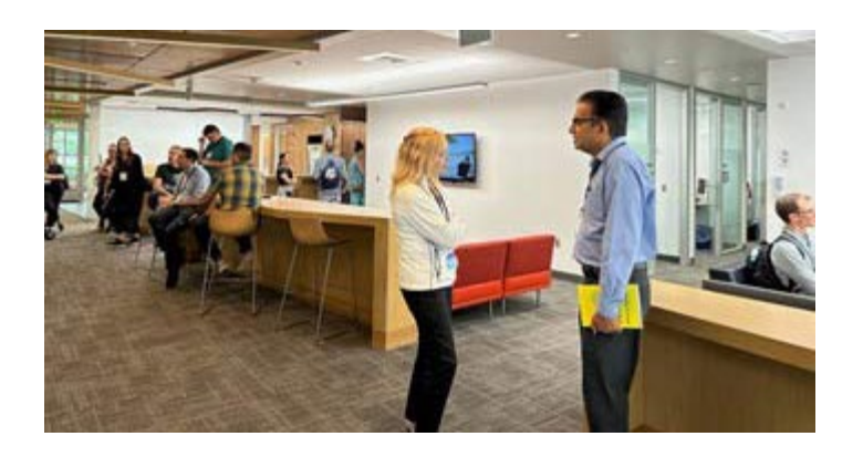
(GIR members exploring The Hub.)