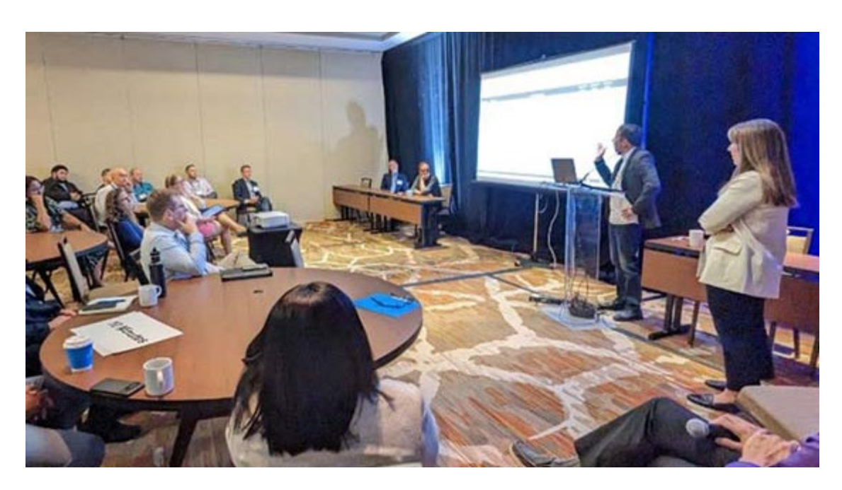
(Participants attending one of the many breakout sessions)