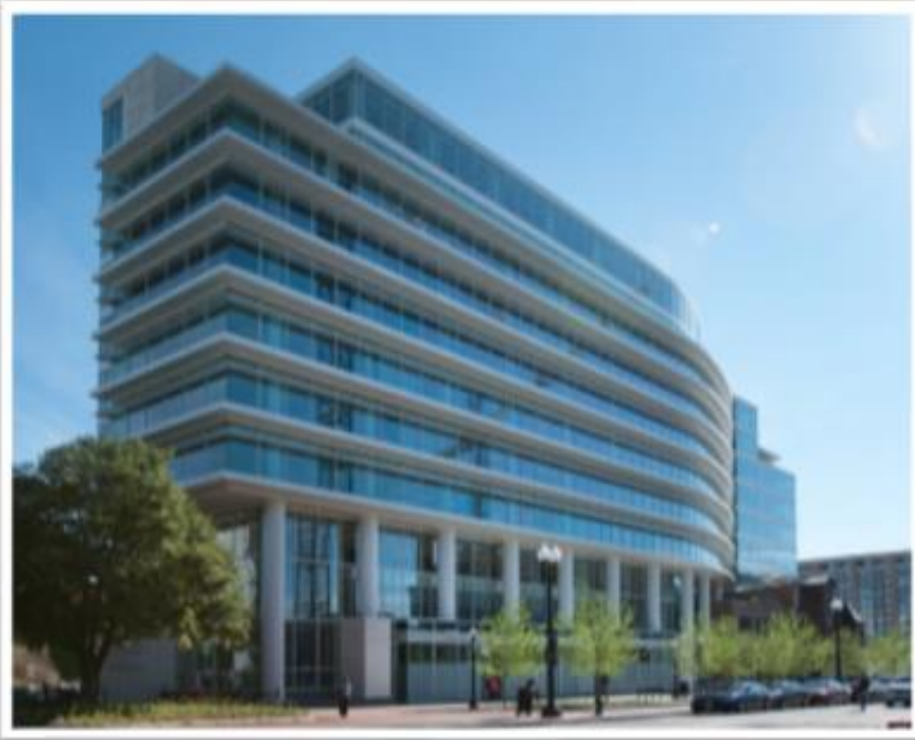
AAMC Washington Headquarters

Goal: Convene executives of AAMC-member societies and society reps, along with AAMC leaders to create and reinforce a stronger connection between the association and its member societies.