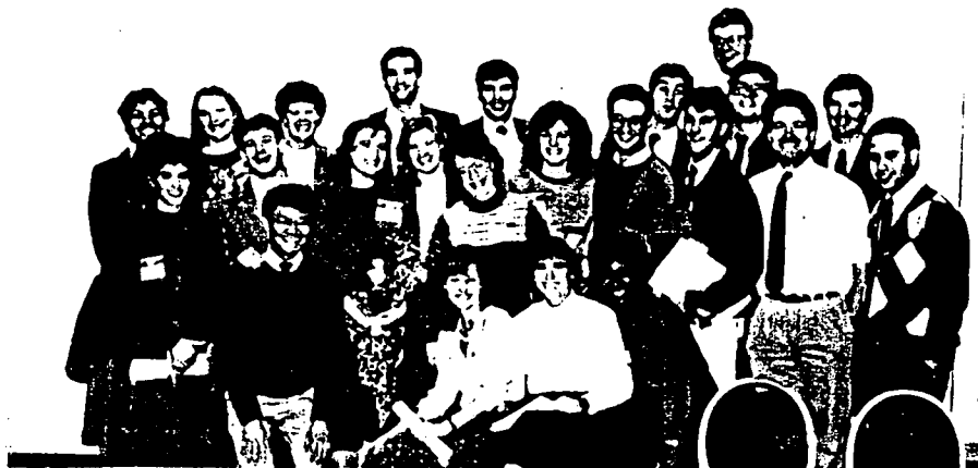
Northeast OSR members after the last meeting