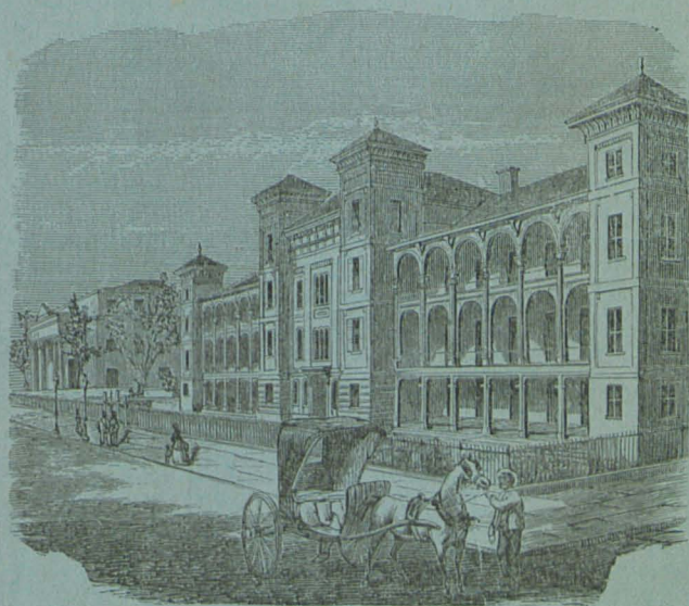
ROPER HOSPITAL AND MEDICAL COLLEGE.